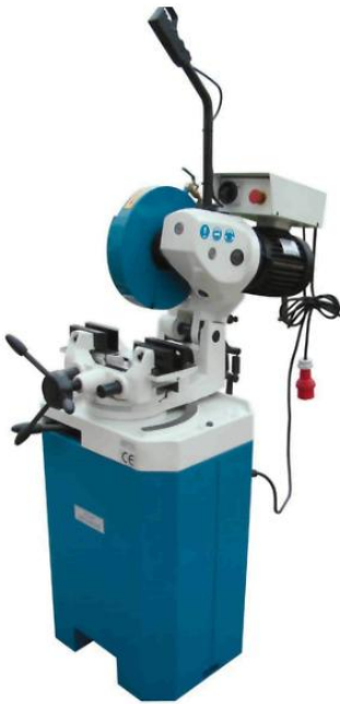
Weipert CS 315