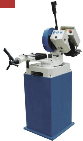
Weipert CS 275