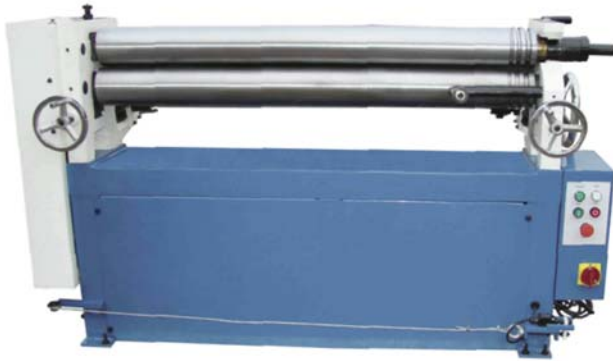
3-Roll Bending Machine