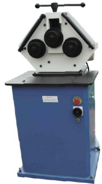
Ring and Profil bending Machine